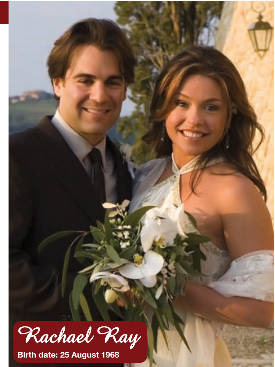
Rachael Ray Birth date: 25 August 1968

The success and happiness of any relationship will be dependent on your willingness to move away to another location and to disconnect yourself from being dependent on your family.