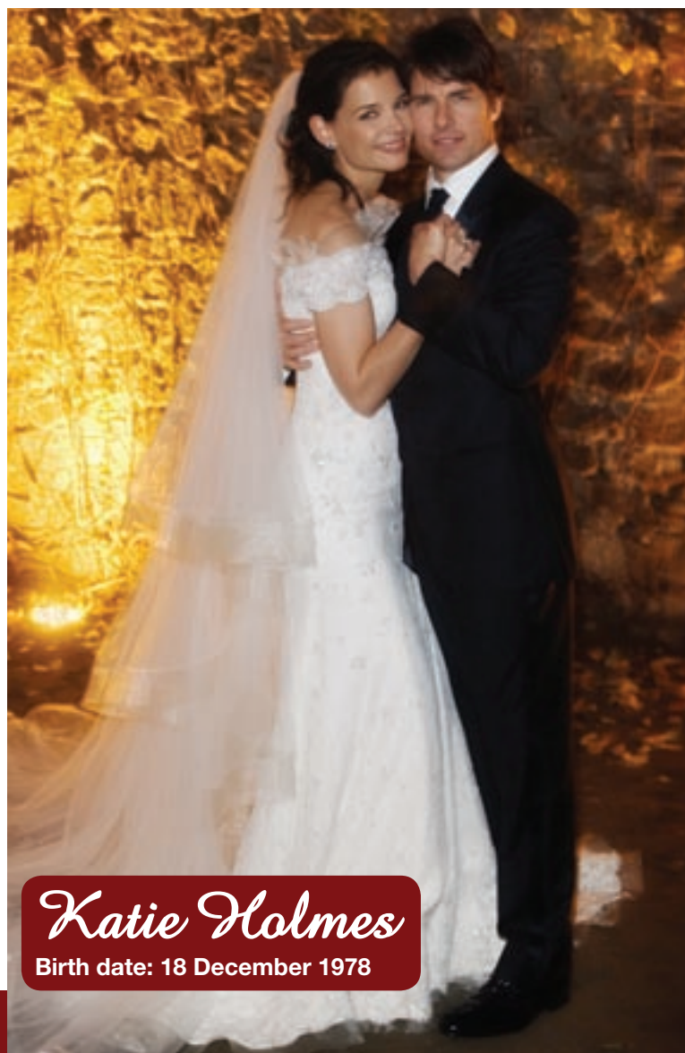
Katie Holmes Birth date: 18 December 1978

Those who are brave enough to travel far will have better chances at finding the ultimate match. Do not take advice from family and friends as they might lead you to make the wrong decisions.