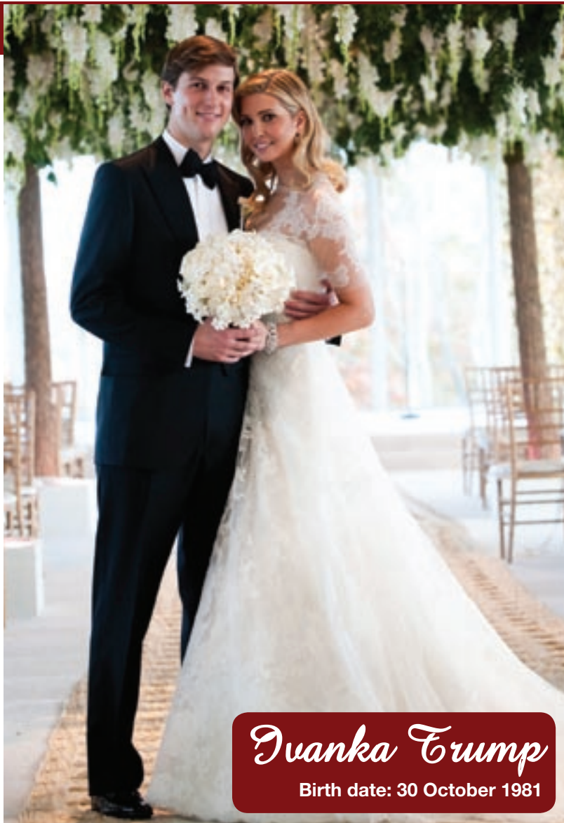
Ivanka Trump Birth date: 30 October 1981