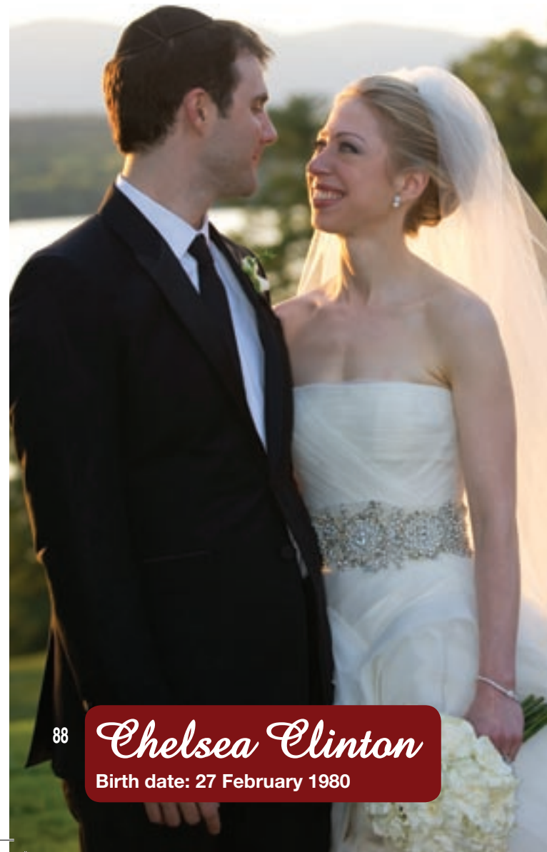
Chelsea Clinton Birth date: 27 February 1980

Emotionally, you have all the power in order to overcome crises. Do not sit back and wait for something to happen. If your loved one is located far from you, it might be the one you've always wanted to be with.