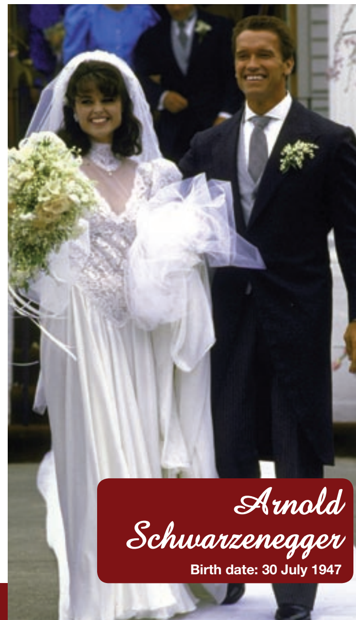
Arnold Schwarzenegger Birth date: 30 July 1947

The personality differences between you and your loved one might cause you frustration. This year, your lesson is to learn to love and accept others as they are as only this approach can lead you to peace and harmony.