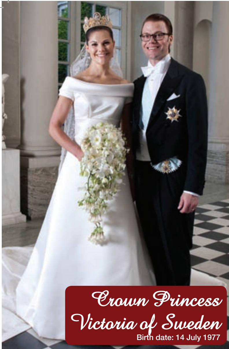
Crown Princess Victoria of Sweden Birth date: 14 July 1977