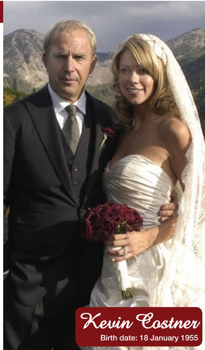
Kevin Costner Birth date: 18 January 1955

Marriage should be before May in order to avoid sudden disappointment. Try and avoid being involved with someone younger than you as this might not last forever.