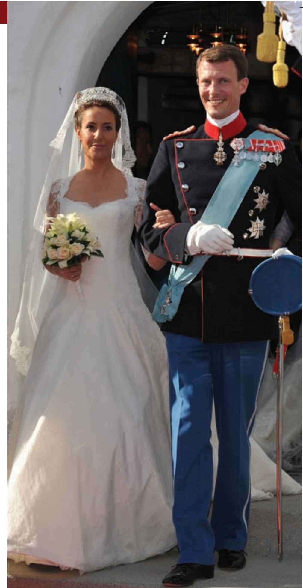
Princess Marie of Denmark Birth date: 6 February 1976

If you recently got involved in a new relationship, make sure that your loved one is emotionally available. Loyalty is the key to your happy love life in the coming years.