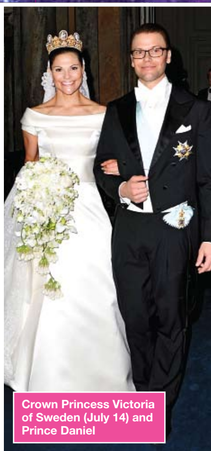
Crown Princess Victoria of Sweden (July 14) and Prince Daniel

Marriage can happen this year if you and your loved one are willing to dedicate yourselves to one another. But there is a high possibility that your sweetheart is not yet ready to settle down or to finally commit. Until March, you will still be in a relationship that you were involved in last year. However, as of April you will suddenly feel lighter and more open to a new experience. A relationship with someone from abroad is possible, yet it may cause great doubts and frustration in terms of expectations. Stay away from married people, as you will discover this to be a waste of time.