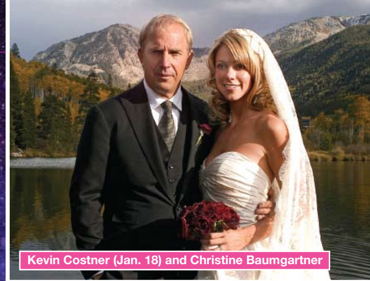
Kevin Costner (Jan. 18) and Christine Baumgartner