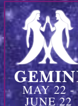
GEMINI MAY 22 - JUNE 22

The year 2011 will be the end and the beginning of a new period. Until June, doubt and fear of changing your life might disturb you and keep you from making final decisions. However, from June 2011 until the middle of 2012, you will find it much easier to solve problems that have been lingering.