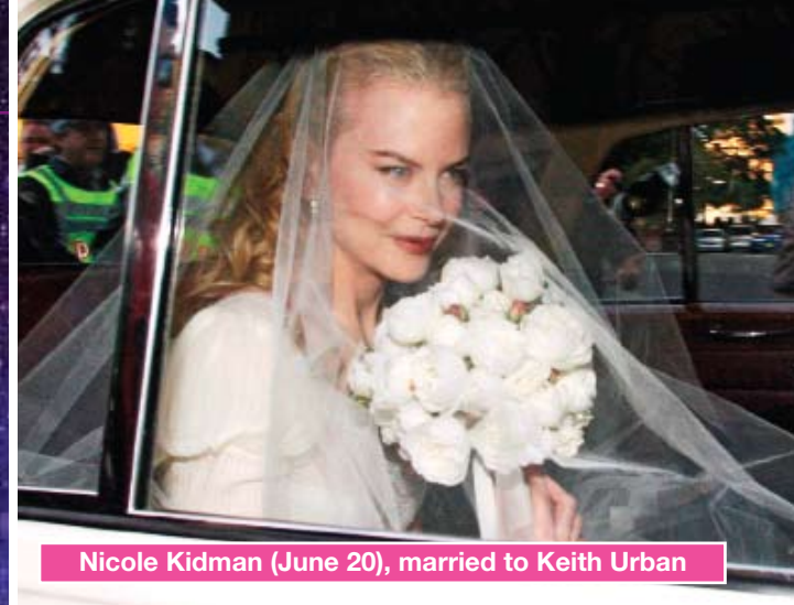
Nicole Kidman (June 20), married to Keith Urban

Through hard work and a commitment to increasing responsibilities, you will achieve success and stability. If you are experiencing bad relationships with colleagues, it's time to look for a better place or insist on better work conditions. Your financial situation will improve in the summer months due to the support of your family or because of a better salary, yet you will still suffer from high property expenses or from bank loans that you took out in the past year.