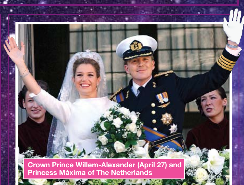
Crown Prince Willem-Alexander (April 27) and Princess Máxima of The Netherlands

The year 2011 will be successful in terms of romance and marriage. Throughout the year, you will make new friends, some of them from faraway places. Between January and May, the lucky planet Jupiter will be in your sign and will bring new excitement and popularity within the realm of romance. Although the presence of Saturn in Libra can cause problems with the physical aspect of your current relationship, you might eventually decide to get married after years of disappointments. TIP: It will not be recommended to hold on to a relationship that has suffered from past instability or infidelity. Try to be realistic and judge the situation logically before making a final decision.