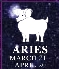
ARIES MARCH 21 - APRIL 20

This will be a very unusual and unpredictable year. Between January and May, the planet Jupiter will be in your sign and you will need to take advantage of this positive position. This is the time to travel abroad for further studies or to relocate to a better place. Uranus will enter your sign in March; together with Saturn in your seventh house, this position can cause delays and controversies in your personal life. However, it can also advance marriage and second chapters for those already divorced. Your health is still sensitive and this year you will need to maintain a healthy lifestyle. If you are born between March 21 and 26, you are likely to go through major changes at work as well as in your personal life.