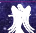
VIRGO AUGUST 24 - SEPTEMBER 23

a relationship will make you feel committed; almost immediately, talk of marriage will make its way into your conversation. Apart from the months of October and November, 2011 is a good year for marriage and financial activity.