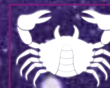
CANCER JUNE 23 - JULY 23

This will be a creative and challenging year. Your success depends greatly on your efforts at improving work and family relationships and on using your new connections with influential individuals.