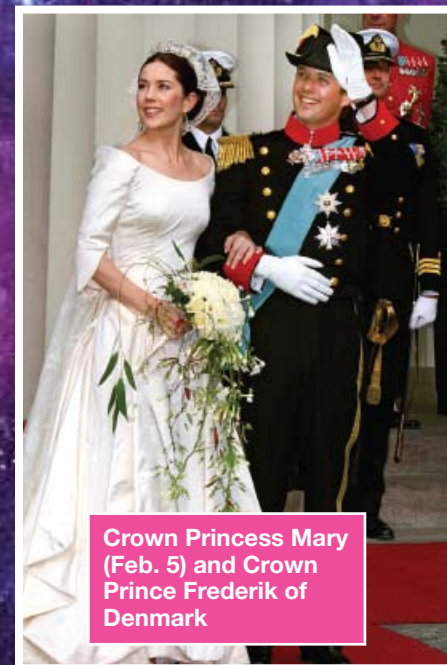
Crown Princess Mary (Feb. 5) and Crown Prince Frederik of Denmark

After years of bad experiences and broken hearts, you can now find a serious relationship and get married. Marriage plans should be timed between January and May; this is especially important if you are getting married to someone you have known for the last few years. The month of April, though, is not recommended for travel or for a marriage ceremony.