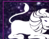
LEO JULY 24 - AUGUST 23

Finding love on the Internet or during studies can lead to marriage. Between January and May, you can expect a relationship to become more serious. It is likely to lead to travel and possibly settling down. If you have been dating someone for the last year and are planning to get married, then a good time to settle down would be March, late June (until July 20) or November. TIP: A love affair with someone younger than you will lead to frustrating situations. You will have to make certain that the object of your affection is emotionally ready for a new romantic relationship.