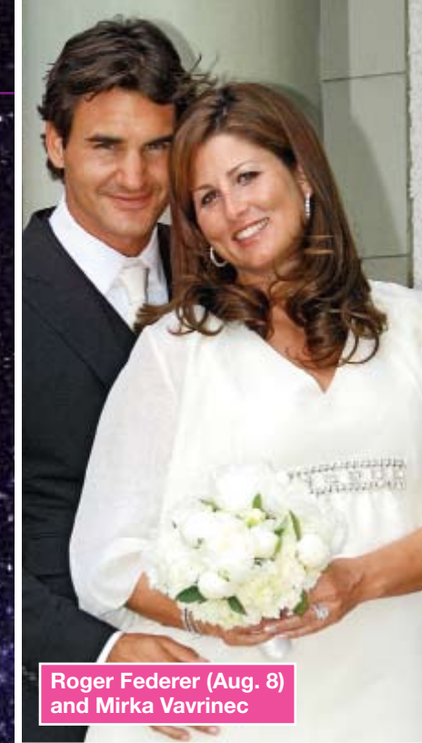
Roger Federer (Aug. 8) and Mirka Vavrinec

You will soon feel strong enough to leave behind a relationship that has caused you many moments of tension and frustration. As a Leo, you are always willing to forgive, and this time it's in your favour to do so only if a final separation follows. You can now expect to find a quiet and secure relationship that will give you the stability that you deserve. Such