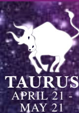
TAURUS APRIL 21 - MAY 21

The year 2011 is one with great potential for personal and professional success. The beginning of the year will be very demanding; you will need to be quick in responding to new work offers, especially if you're looking to make a career transition. Work and personal relationships will go through many ups and downs and you will need to fight to get what you deserve. However, relief will arrive in June, when the lucky planet Jupiter will enter your sign and remain there until June 2012. Also, the presence of Saturn in your health house can lead a chronic disorder to deteriorate.